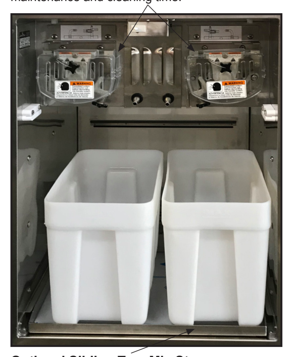
Optional Sliding Tray Mix Storage Mix tray slides out with mix containers in place which makes adding mix quicker and easier.

New pump forward design reduces maintenance and cleaning time.